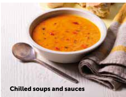
Chilled soups and sauces