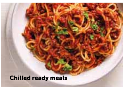
Chilled ready meals