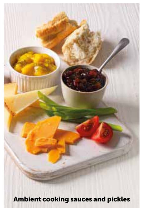
Ambient cooking sauces and pickles