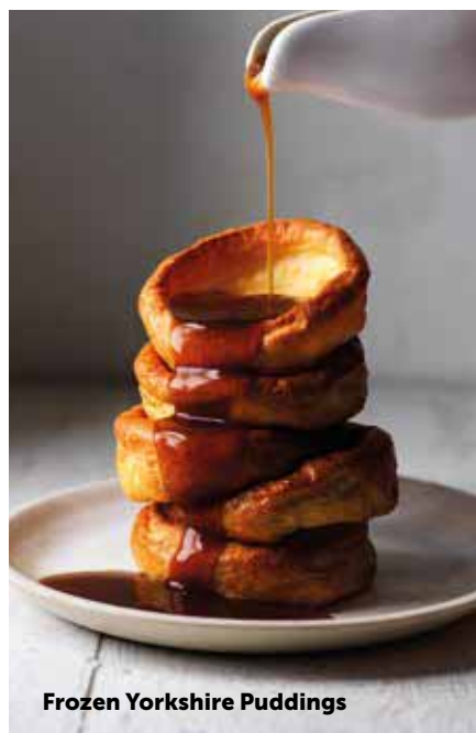
Frozen Yorkshire Puddings